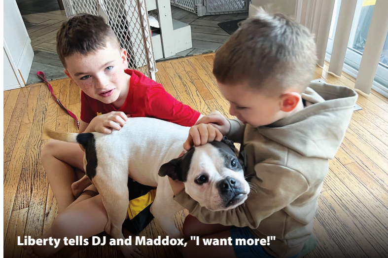
Liberty tells DJ and Maddox, "I want more!"

ways for your dog to get comfortable with being around their human sibling without direct contact.